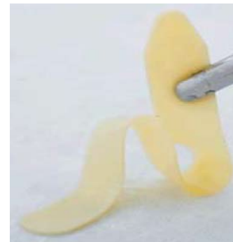
C. XenoSure Model 0.8x8cm (tapered for easier suturing)

The Xenosure Biological Patch has two sides with different appearance: a fibrinocollagenous or fibrous surface with cilia (small hairs) and a serous side, which has a hairless and glistening surface. The image below illustrates the fibrous and serous sides. Non-clinical acute thrombogenicity tests have demonstrated that the serous side of bovine pericardial tissue is less thrombogenic than the fibrous side and should be placed towards the flow of blood.