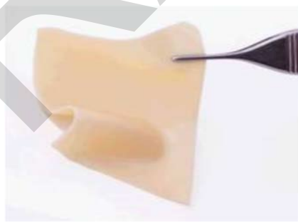
B. XenoSure Model 4x4 cm (square shape)